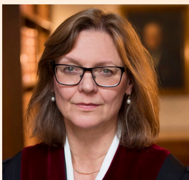
Hon'ble Justice Hilde Indreberg Judge (Retd.), Supreme Court of Norway