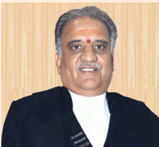
Hon'ble Justice Hari Haranadha Sarma Judge, The High Court of Judicature at Andhra Pradesh