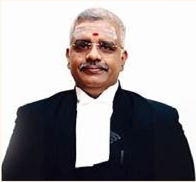
Hon'ble Justice N Anand Venkatesh Judge, The High Court of Judicature at Madras